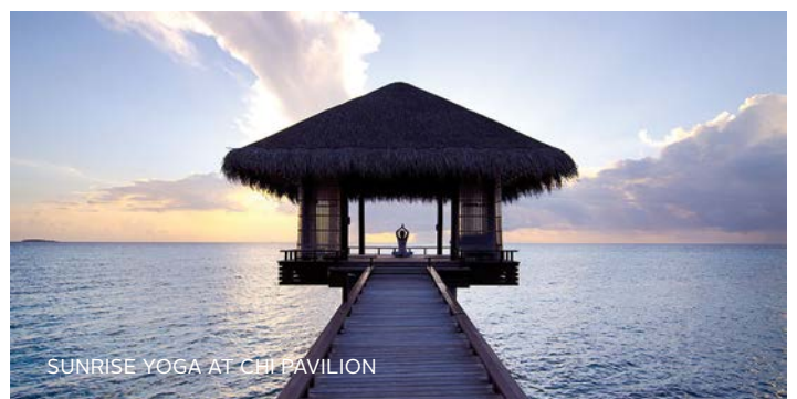
SUNRISE YOGA AT CHI PAVILION