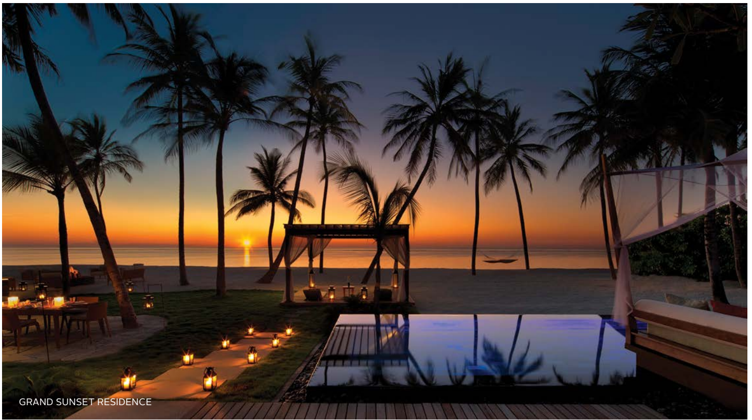
GRAND SUNSET RESIDENCE