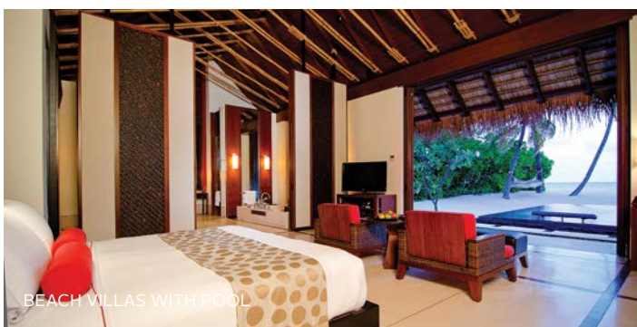
BEACH VILLAS WITH POOL