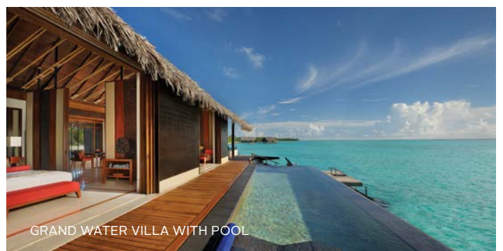
GRAND WATER VILLA WITH POOL